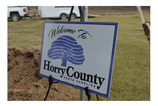
Thursday, August 29th Marina Inn at Grande Dunes 11:45AM Networking & Lunch 12:00PM Event Begins

Sponsored by \underline{\mathsf{McLeod}\;\mathsf{Health}}