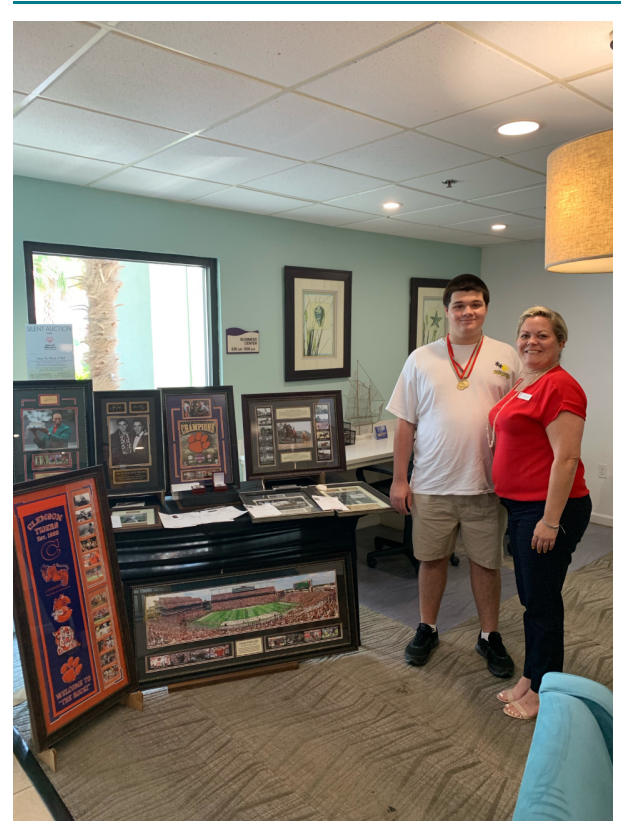
Liberty Tax Service NMB Voted #1 Office in

Best Western Intracoastal Has a Silent Auction Going on for Local Special Olympics