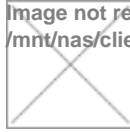
Image not readable or empty /mnt/nas/clients/mbredc_html//media/images/Waccamaw_Dist_Bldg_%281%29.JPG